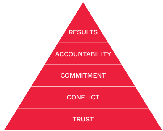
The Five Behaviors Model

The experience is completed through a half-day training session, led by a trained Five Behaviors expert. This session includes a walkthrough of the Personal Development profile, breakout activities, and group discussion.